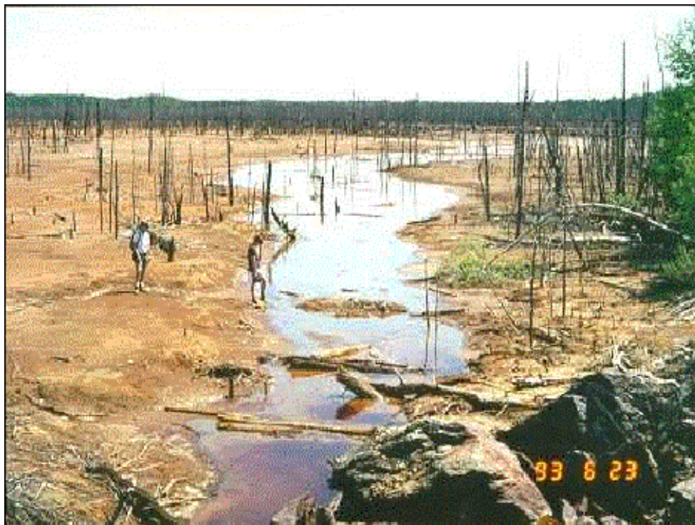
Figure 2: A view of the NUT area, and the northeast seep with a pH of 2 to 3, prior to rehabilitation.