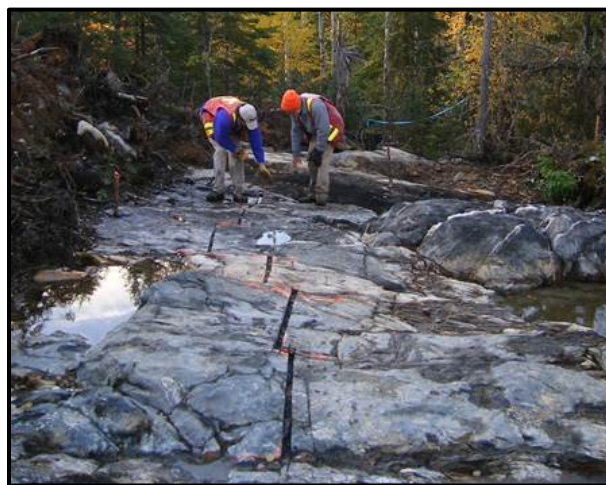
Photo 4: Small area less than 100 square metres stripped, washed and sampled.

Mechanized surface stripping uses heavy equipment to remove vegetation and soil (overburden) from bedrock. Next, pressurized water pumps and hoses, similar to those used to fight forest fires, may then be used to remove remaining soil and debris from the rock surface. The exposed bare rock can reveal information about the presence of minerals. This information is used to draw geological maps that can inform and guide future exploration.