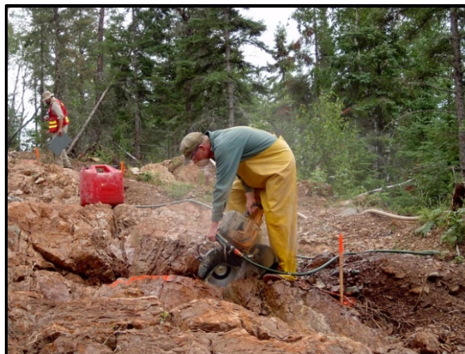
Photo 7: Channel sampling in a small trench less than 3 cubic metres that has also been stripped.

Pits are shallow holes while trenches are generally longer, linear and of variable depth. Rock and soil removed from the trench or pit is stored on site. Some rock samples will be sent for further testing. Excavation can be either by hand, mechanical digger or by bulldozer on sloping ground.