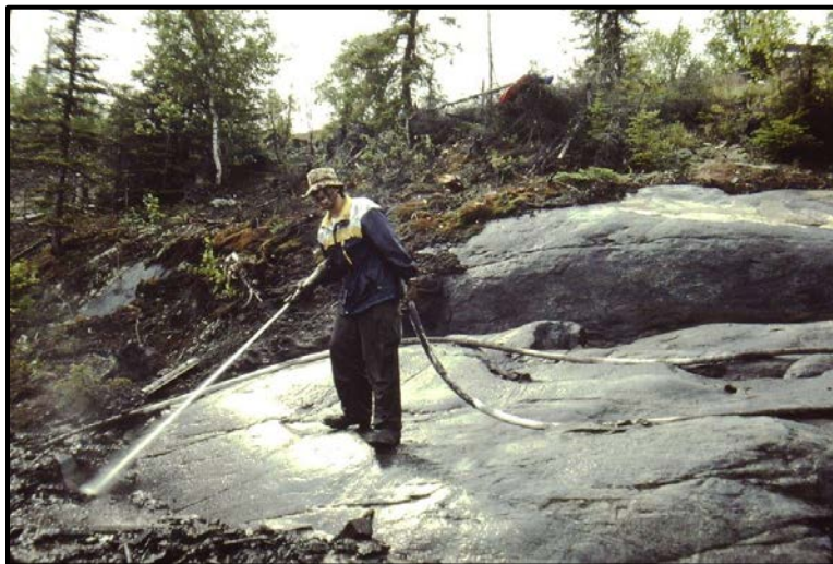
Photo 5: Various techniques including power washing used to strip and wash overburden.

Access trails may be blazed to provide access to the location for people and equipment.