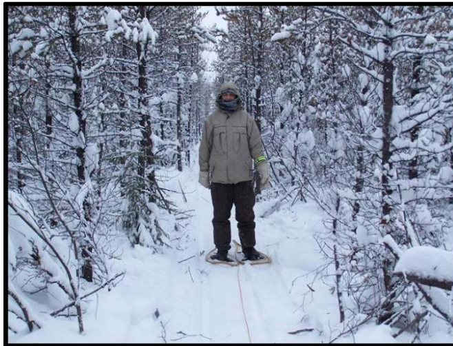
Photo 2: Laying out wire for ground geophysical induced polarization (IP) survey using cut line.

Ground surveys such as induced polarization (IP) surveys involve laying out kilometres of thin wire and placing small metal rods into the ground. At the end of the survey companies will recover these materials used and remove them from the site.