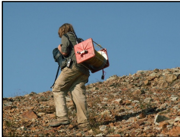
Photo 3: Technician laying wire for an induced polarization (IP) survey.